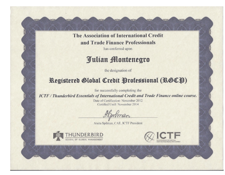
Registered Global Credit Professional (RCGP) certificate.