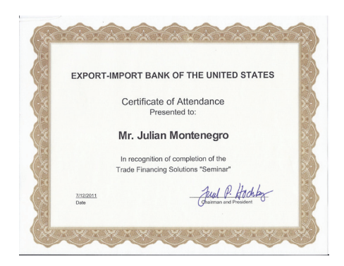
Trade Financing Solution Seminar (EXIM BANK) certificate.